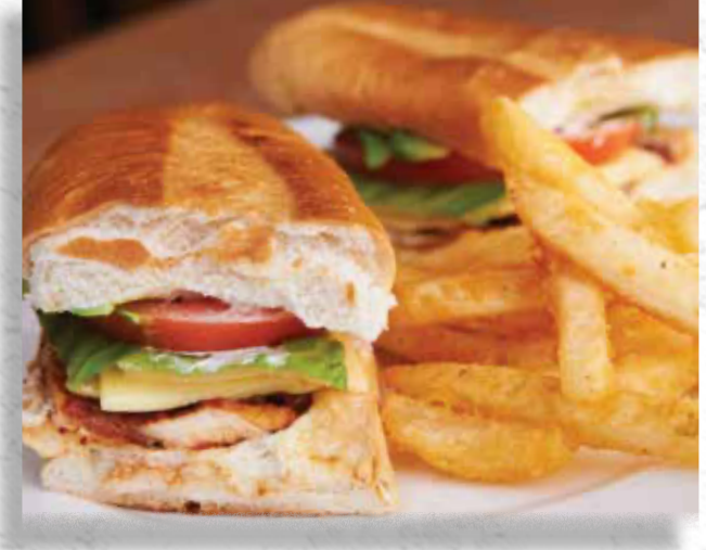
Grilled Chicken Torta