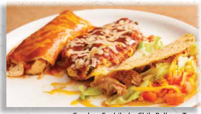
Combo - Enchilada, Chile Relleno, Taco

Marinated shrimp with bacon, shredded cabbage, pico de gallo and jalapeño cilantro sauce. 17.99