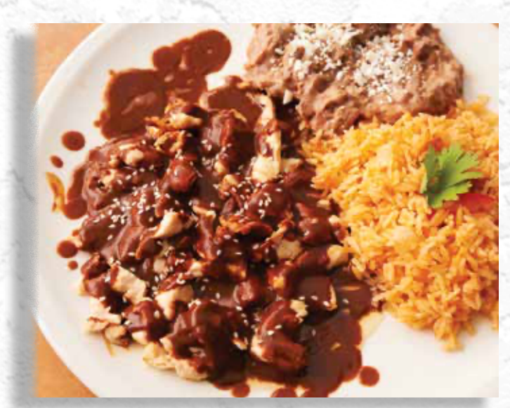
Pollo en Mole