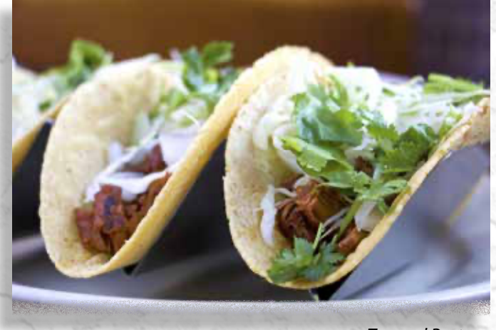
Tacos al Pastor

Three soft tacos served with rice and beans.