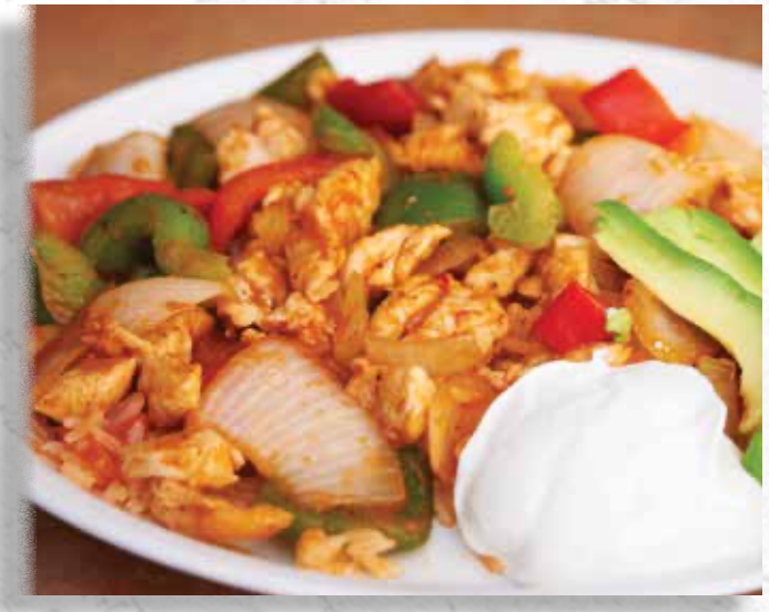
Arroz con Pollo

Chunks of pork loin cooked until tender in a mild green tomatillo sauce of green peppers, onions, cilantro and spices. Served with rice and beans. 17.99